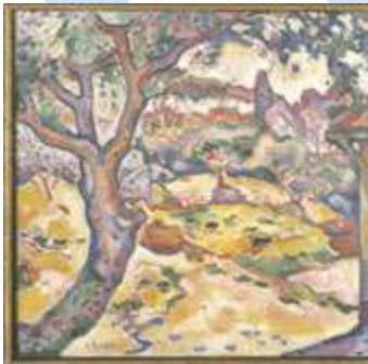
"L'olivier près de l'Estaque" by Georges Braque, 1906, dimensions 50 x 61 cm