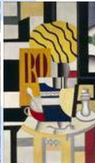
"Nature morte au chandelier" by Fernand Léger, 1922, dimensions 116 x 80 cm