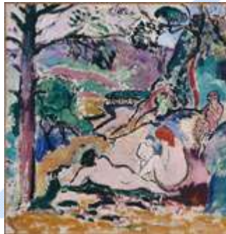
"Pastorale" by Henri Matisse, 1906, dimensions 46 x 55 cm