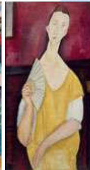
"La femme à l'éventail" by Amedeo Modigliani, 1919, dimensions 100 x 65 cm